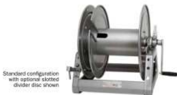
Standard configuration with optional slotted divider disc shown

Part No. 9906.0027. Add 2-1/2" to the X dimensions shown in the chart.