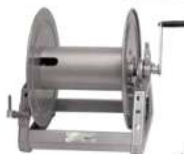
Standard configuration with optional finish shown