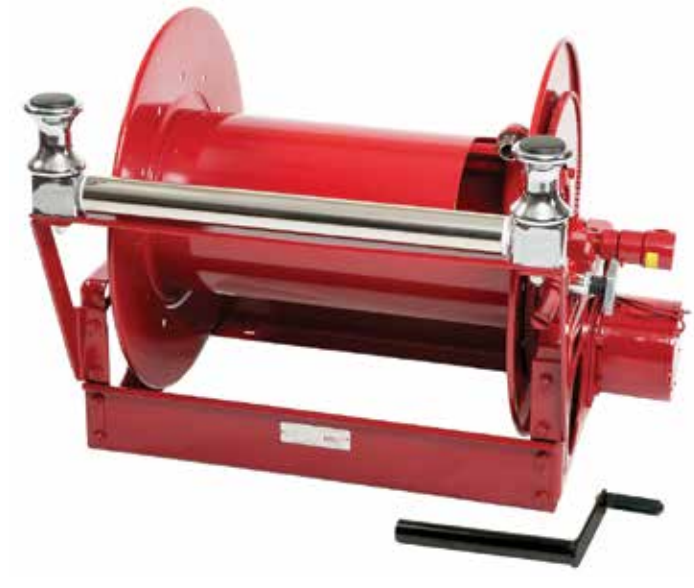
Shown with Electric Rewind (E), optional red finish and optional roller and spool assembly

See chart for capacity on page 18, or consult factory.