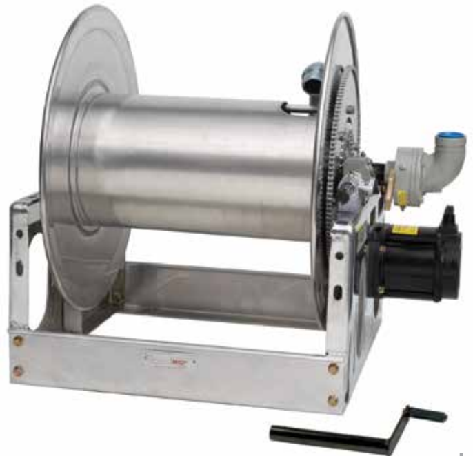
Standard configuration shown with Electric Rewind (EP) and optional polished aluminum construction

CAUTION: When using Niedner|Altra® hose, a special riser and/or larger drum diameter is required.