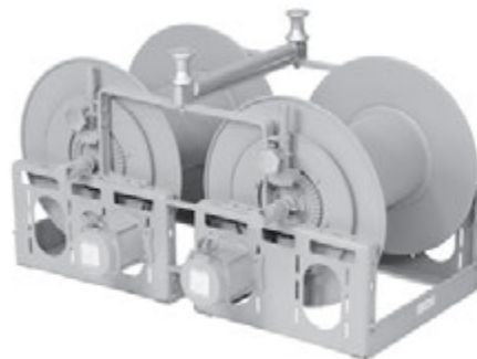
Two F Series reels, and a standard Twin Fire Reel Conversion Kit

Twin booster hose reels combine matched F or FF Series reels in a single unit with a center-mounted roller and spool assembly. Hose from both reels can be used on either side of the truck. Rugged unit frame construction maintains alignment and simplifies installation when two reels are combined.