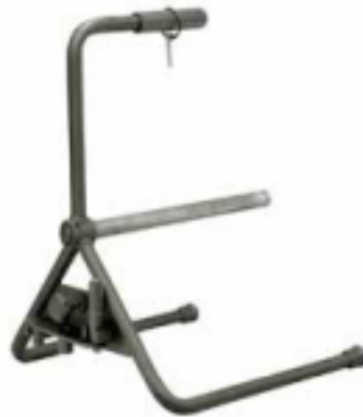
AVCQ Frame – includes crank handle (Part No. 9906.0910)