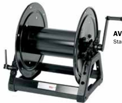
AVC1500 Standard configuration shown

Note: This disc location must be specified.