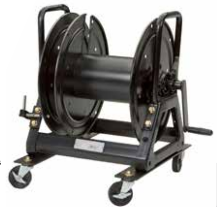
AVC1520-17-18 Options shown: • Slotted divider disc • Heavy-duty casters • Carrying handles • Caster extension brackets (see Note 3)