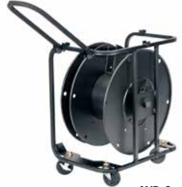
AVD-2 With optional casters and pull handle