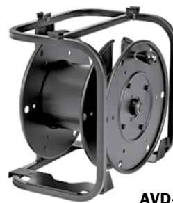
AVD-1 With caster mounting plates