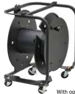
AVD-3 With optional casters