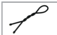
AVX-100 Standard configuration shown (cable not supplied with reel)

AVX Series includes one durable rubber twist tie for cable ends. Part No. 9949.0082