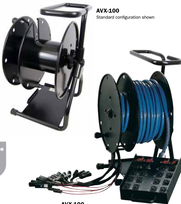
AVX-100 Standard configuration shown